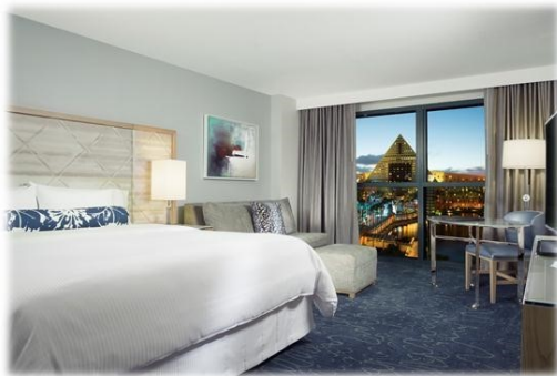
New room design for the Swan (758 guest rooms)